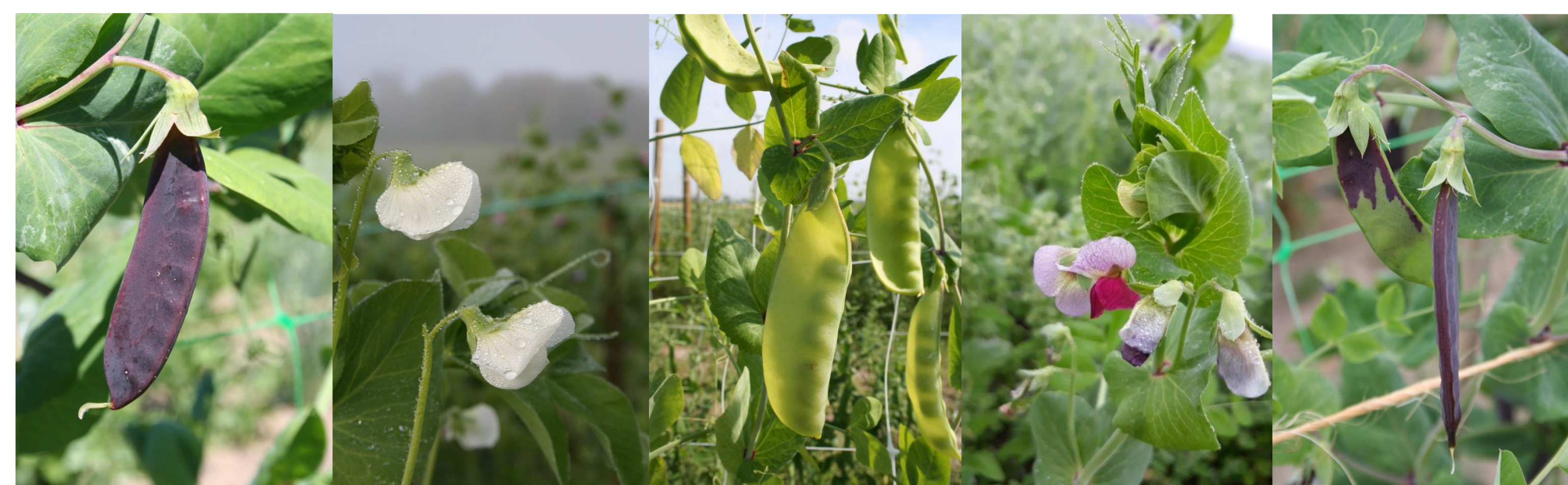
20201 Grötom (SE) 23819 Tidlig lav (NO) 17882 Gästrikland (SE) 24334 Bjurholms gråårt (SE) 20201 Grötom (SE)

Due to yearly differences in disease pressure in field trials, scoring and identification of disease resistance is sometimes not possible because of low infection rate. Therefore, a promising marker targeting Erysiphe pisi -resistance (SSR A5) will be examined and optimized on a subset of pea accessions. DNA from selected accessions has been extracted and the selected marker is used to genotype the accessions for resistance genes.