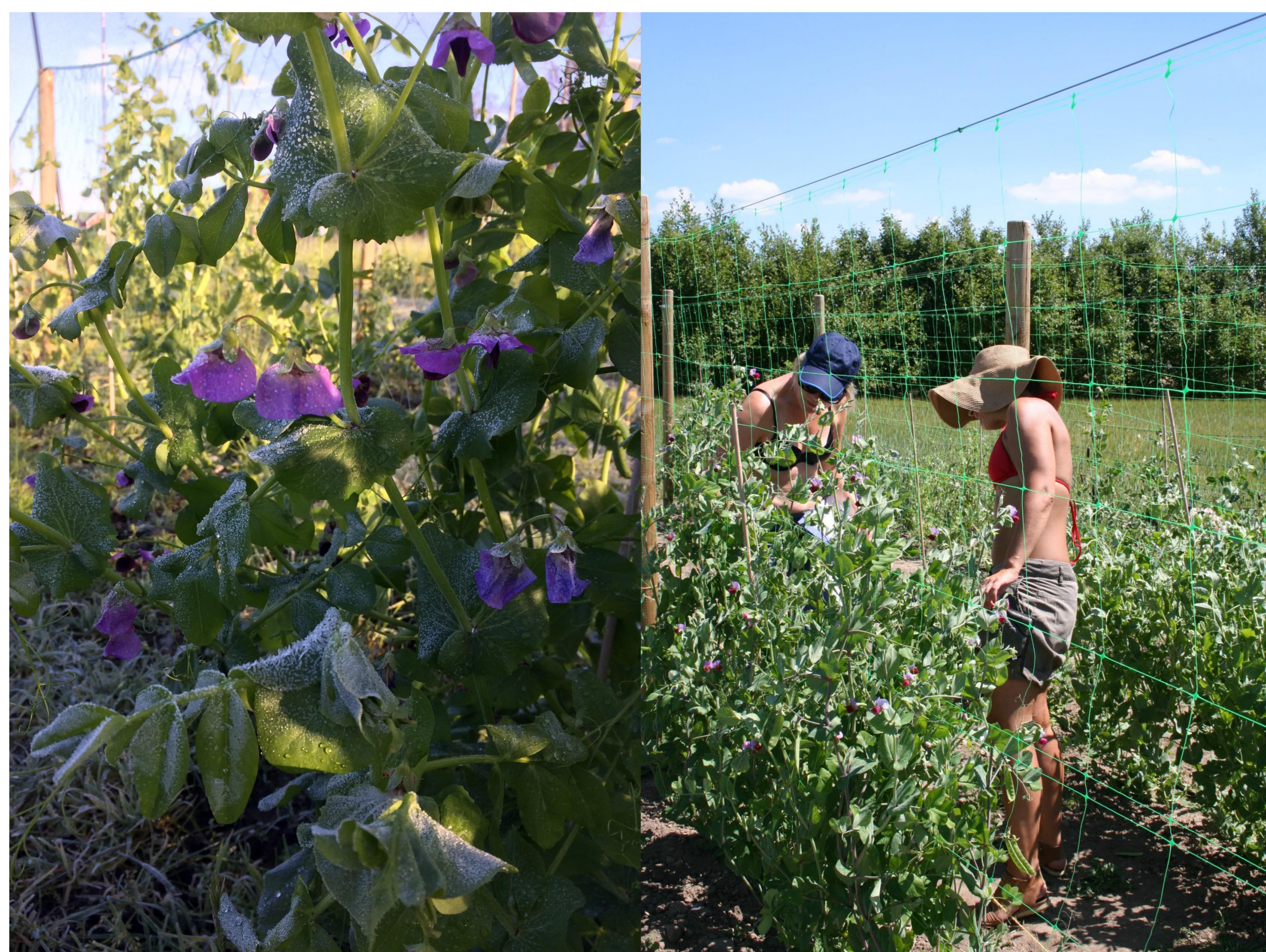
Frost in Tromsø, Norway, October 2018.

● Location of accessions with specific geographic origin (landraces)