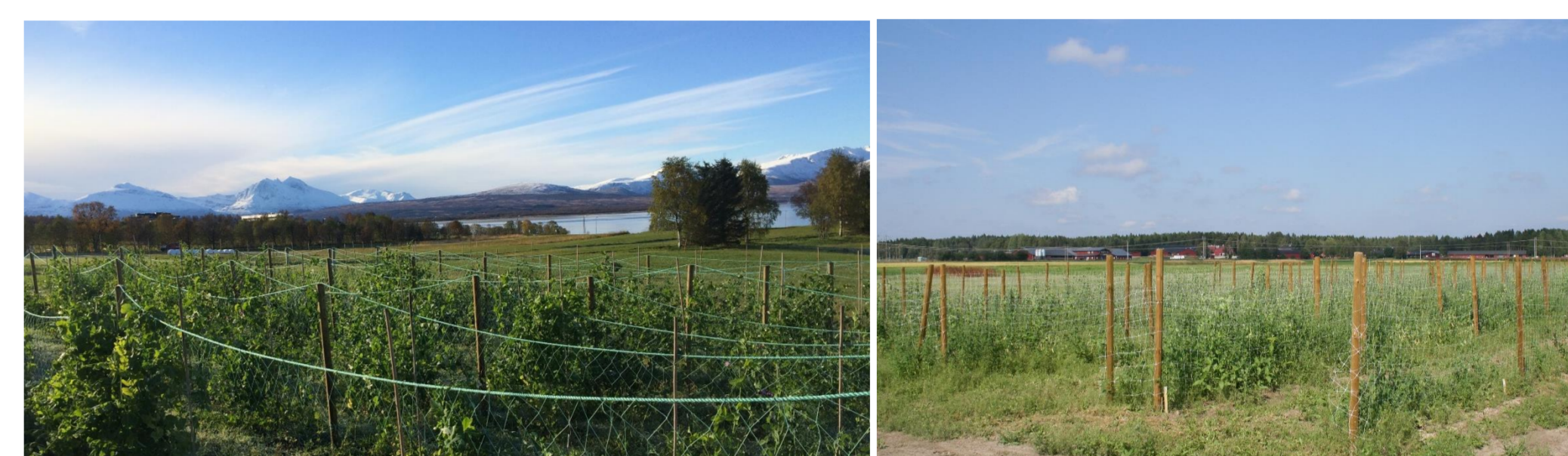
Tromsø, Norway. Umeå, Sweden.