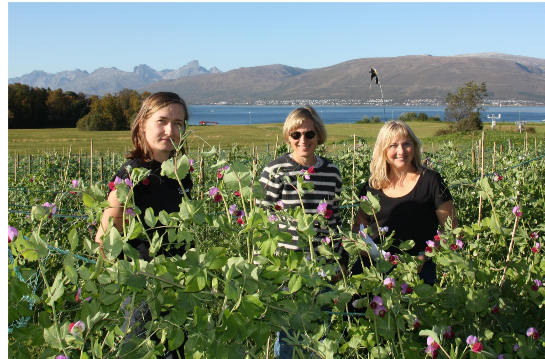
Field inspection in Tromsø, Norway.

The project also aims to increase the knowledge and use of the Nordic pea accessions conserved at NordGen, and strengthen the collaboration between companies, organizations and researchers in the Nordic countries.